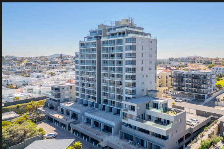
Table View at a glance