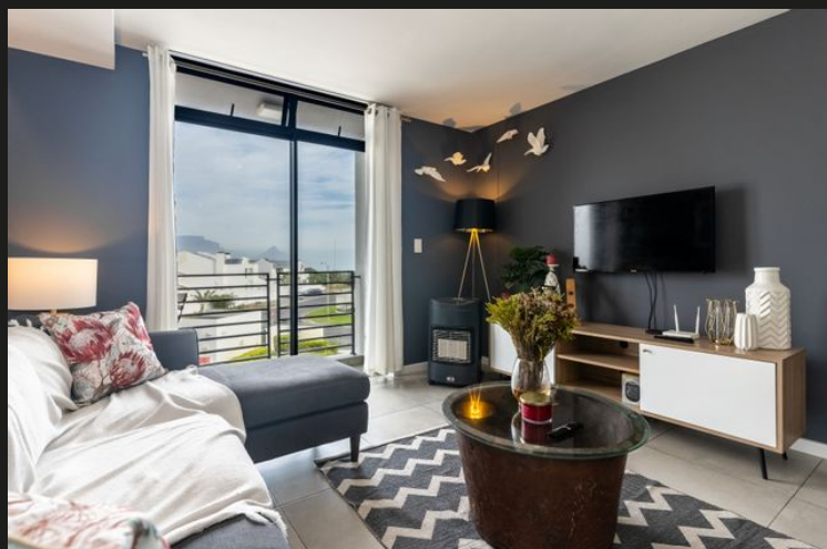
Table View at a glance