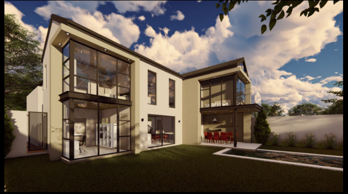
*the above are artists impressions *the below photos are of similar reference sites