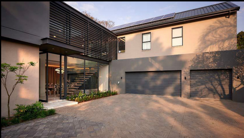
photos of previous similar developments