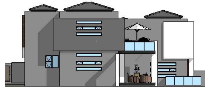
SOUTHEAST ELEVATION SCALE: 1:100