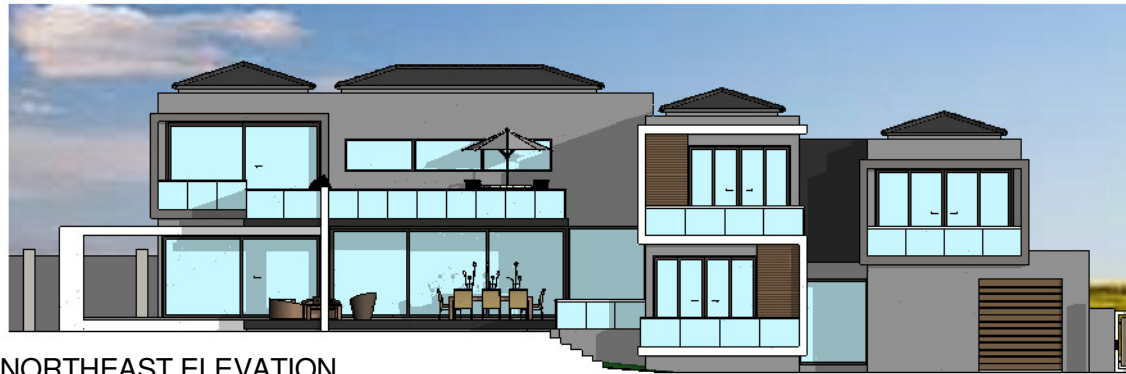
NORTHEAST ELEVATION SCALE: 1:100