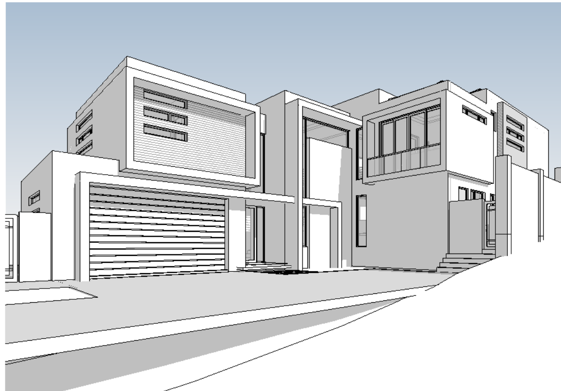
PERSPECTIVE VIEW 1 SCALE: