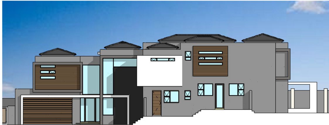
SOUTHWEST ELEVATION SCALE: 1:100