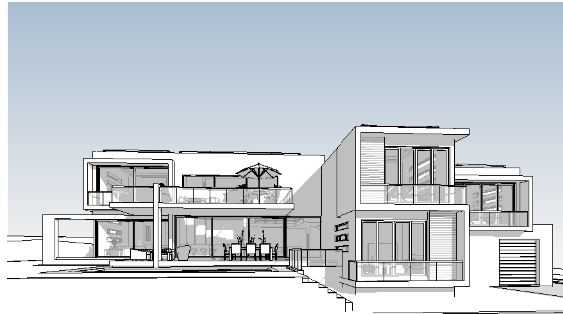
PERSPECTIVE VIEW 2 SCALE: