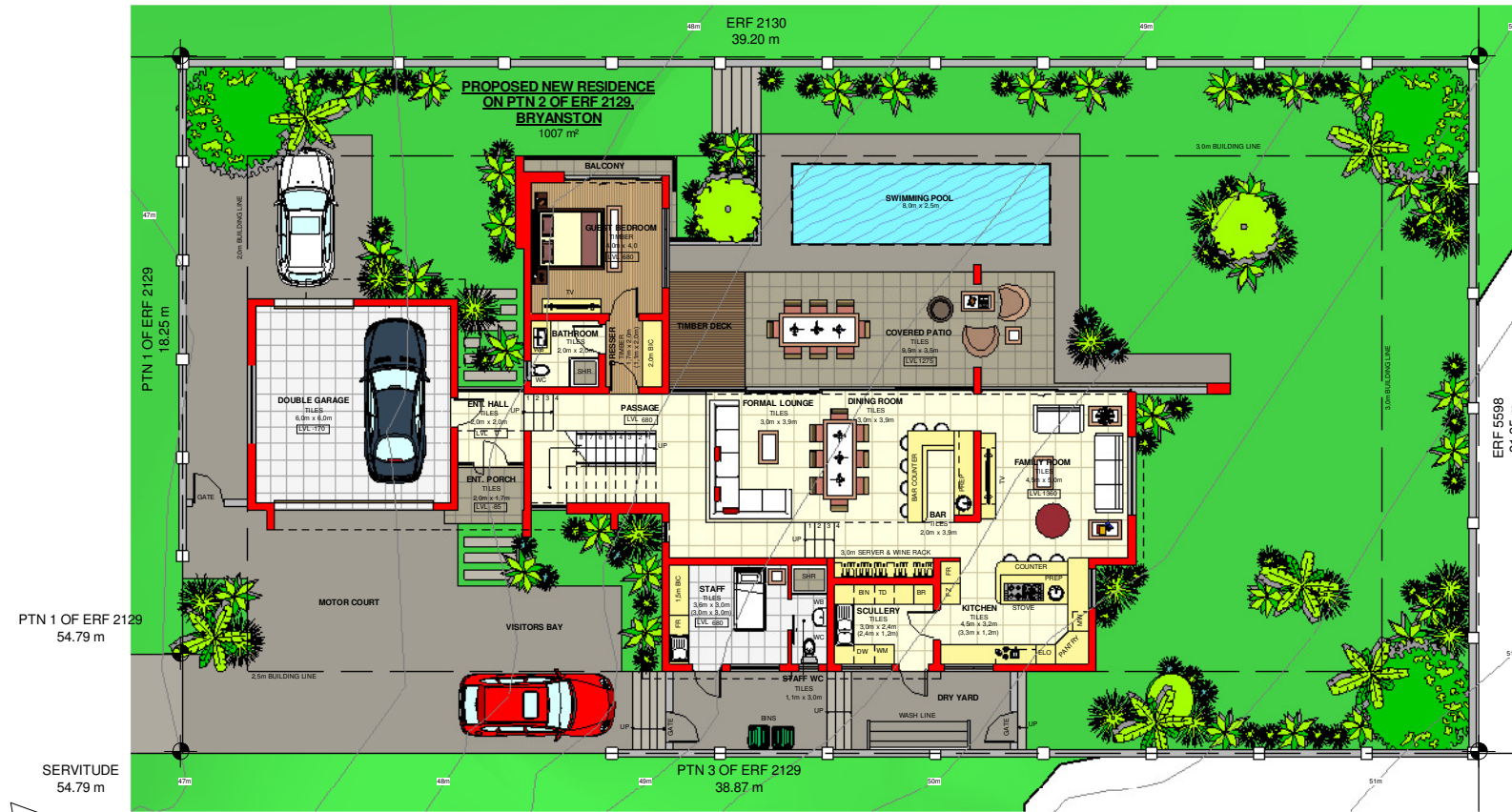
GROUND STOREY PLAN SCALE: 1 : 100